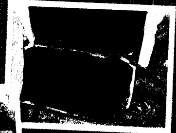
Appendix 75-A Revisions

Revisions for Appendix 75-A, Have Been Adopted http://www.nyhealth.gov/regulations/recently_adopted/docs/2010-02-03_wastewater_treatment_residential_onsite_systems.pdf