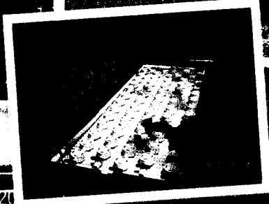
ADVANTEX SYSTEM INSTALLED IN PULTENEY